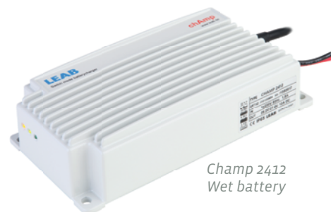
Champ 2412 Wet battery