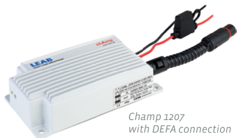
Champ 1207 with DEFA connection