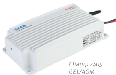
Champ 2405 GEL/AGM