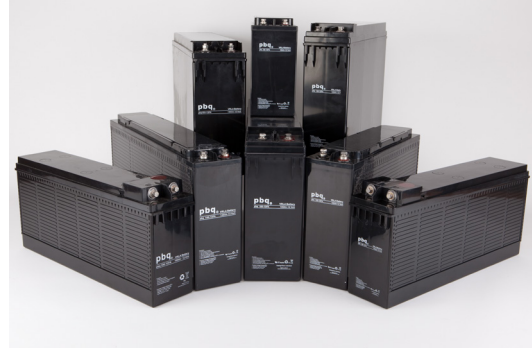
pbq Front Access family

Respect a 10 to 15mm air gap between the batteries on each shelf.