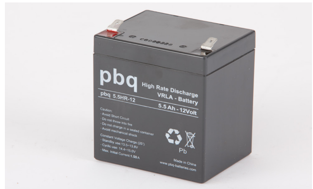
pbq 5.5HR-12 Ideal substitute for wet starter batteries in scooters. Also frequently used for robotics and other high current applications.