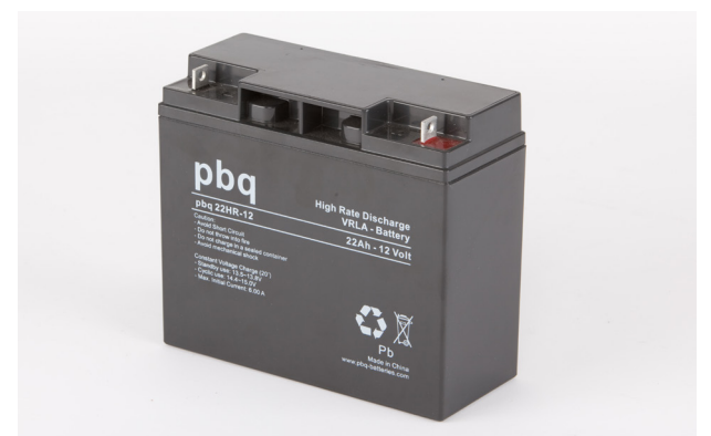
pbq 22HR-12 High Rate Discharge version of the popular 18Ah VRLA battery. More power for your UPS systems without the need of extra shelves or cabinets.