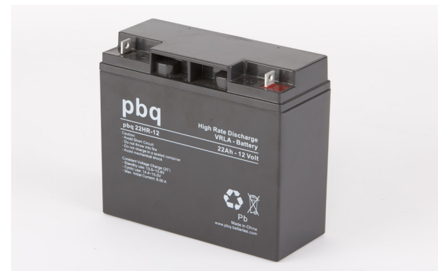
pbq 22HR-12 High Rate Discharge version of the popular 18Ah VRLA battery. More power for your UPS systems without the need of extra shelves or cabinets.