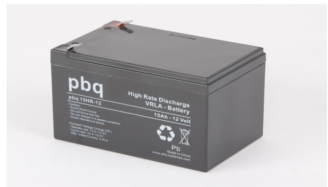
pbq 15HR-12 High Rate Discharge version of the popular 12Ah VRLA battery. Electric bikes, scooters and UPS systems run 25% longer compared to a standard 12Ah.