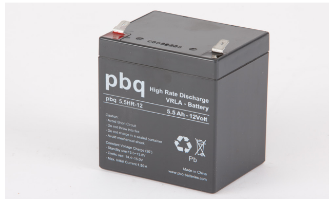
pbq 5.5HR-12 Ideal substitute for wet starter batteries in scooters. Also frequently used for robotics and other high current applications.